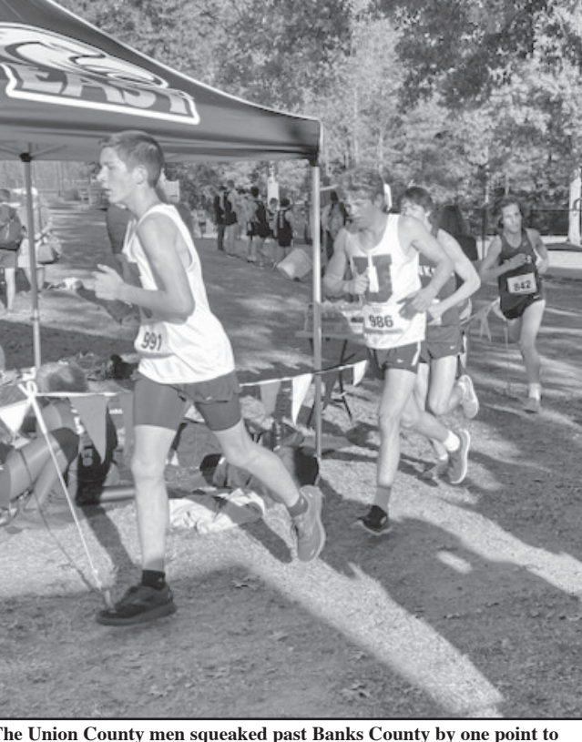
The Union County men squeaked past Banks County by one point to claim the final spot in Saturday's State Championship meet.

Ninth-place junior Benfour on the men's side, edging ton Gregory led the way for Union County, clocking in (94) by one point. The Pan- at 18:25.77 to edge Banks