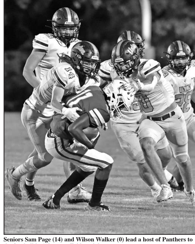
the football in Athens on Friday night.