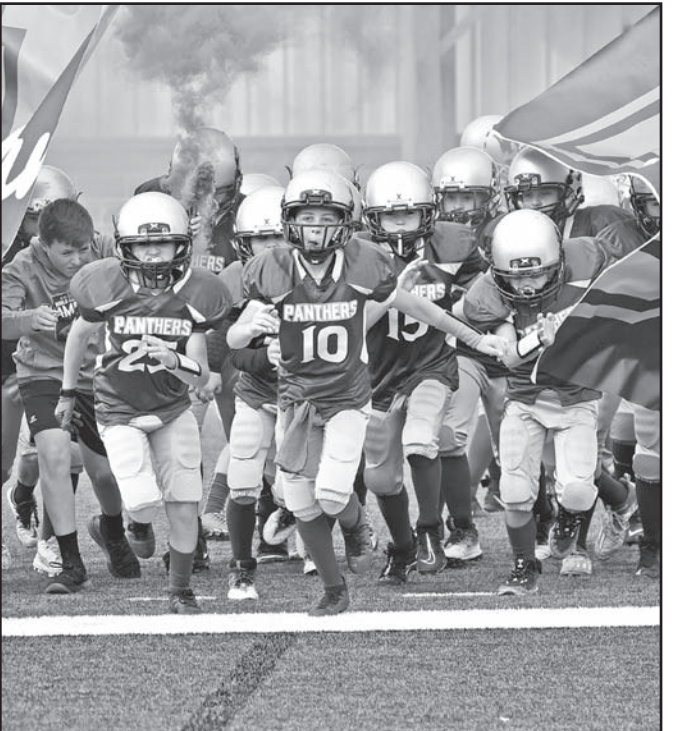
The Union County 5th grade Panthers in action during Saturday's semifinal matchup vs. Pickens.